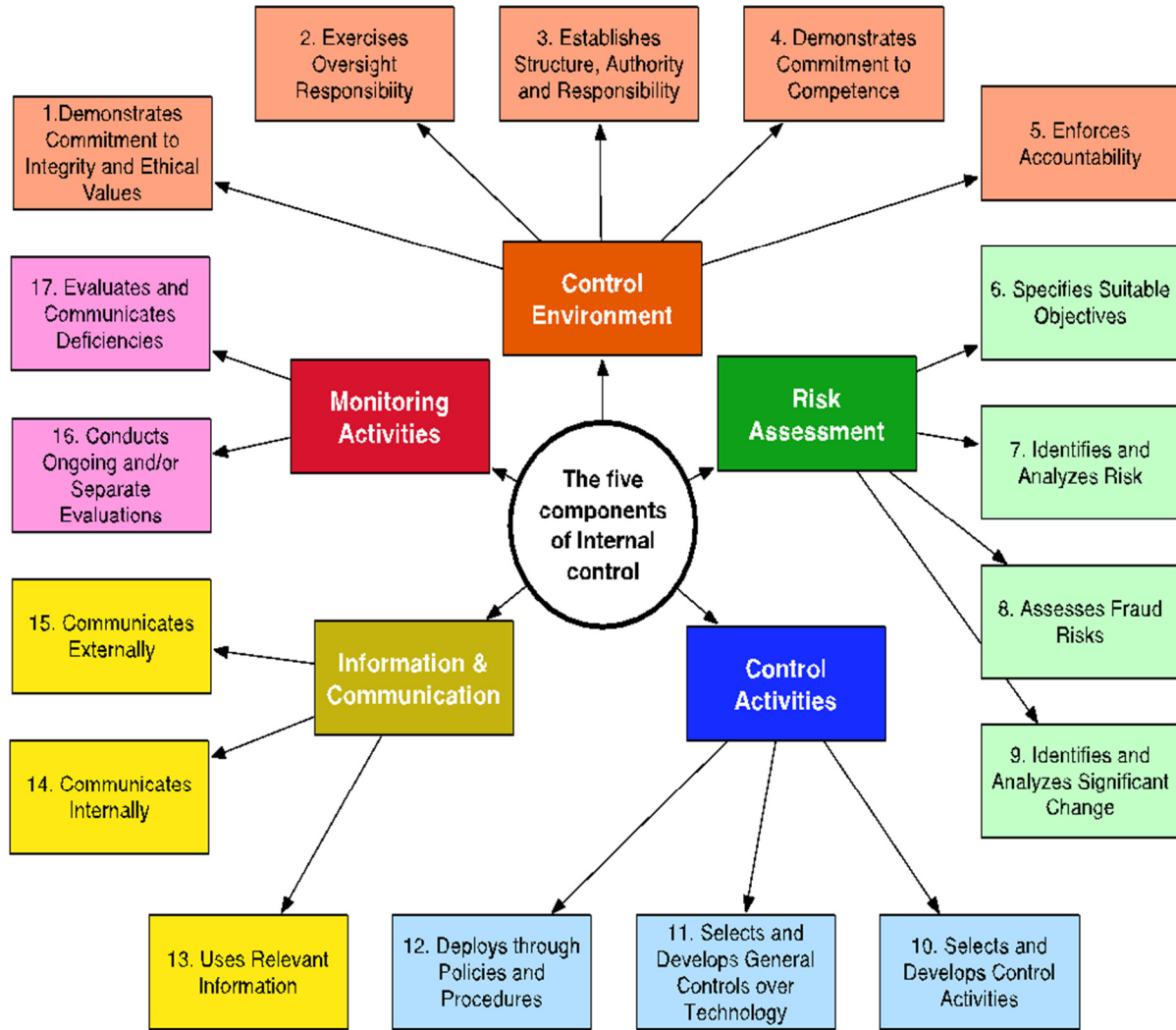
Figure 2. The Five Components and 17 Principles of internal control