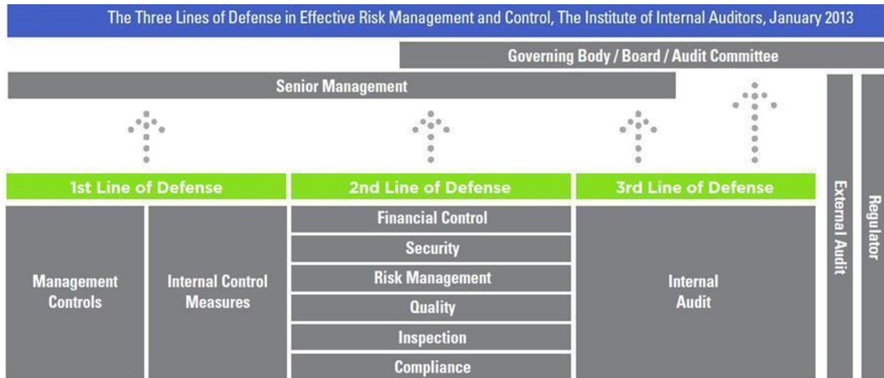
Figure 3. The Three Lines of Defense Model