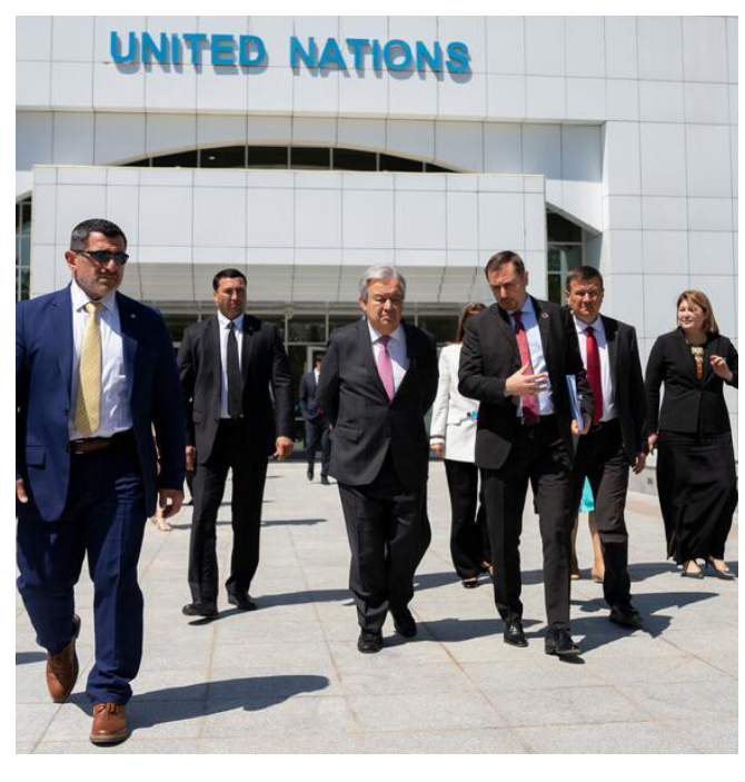
Secretary-General Visits New UN Country Team Building

Evaluations confirmed that resident coordinators in tandem with appropriately staffed offices fostered coherence, enabled policy advice and effectively supported the mainstreaming of normative issues. The System-wide Evaluation of the Development System's Socioeconomic Response to COVID-19 identified the empowered resident coordinator and fully staffed offices as an important factor in achieving coherence in the United Nations response and resident coordinators' offices that were not fully staffed as an impediment. The UNFPA development system reform evaluation also pointed to the fact that resident coordinators and their offices have not always been fully capacitated, which was critical for moving inter-agency processes forward. OIOS evaluations identified that the capacity of resident country offices was a determining factor for achievements in the provision or facilitation of