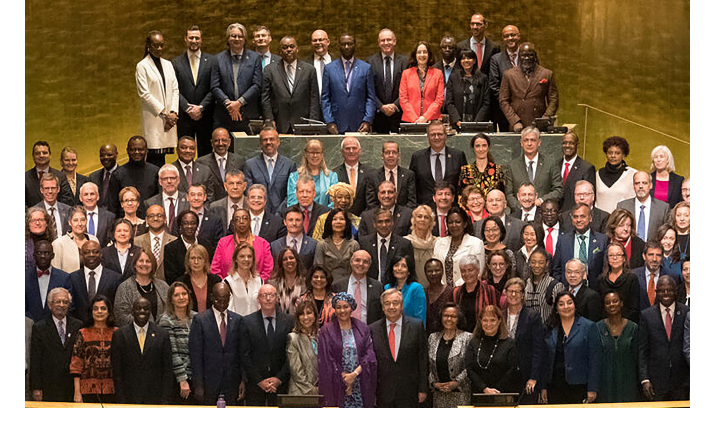
UNSDG SYSTEM-WIDE EVALUATION OFFICE