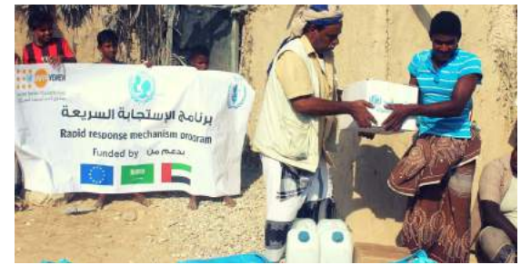
Distribution of RRM kits among displaced families from Hodeidah in Al Mahawit, Al Maharah and Lahj Governorates.