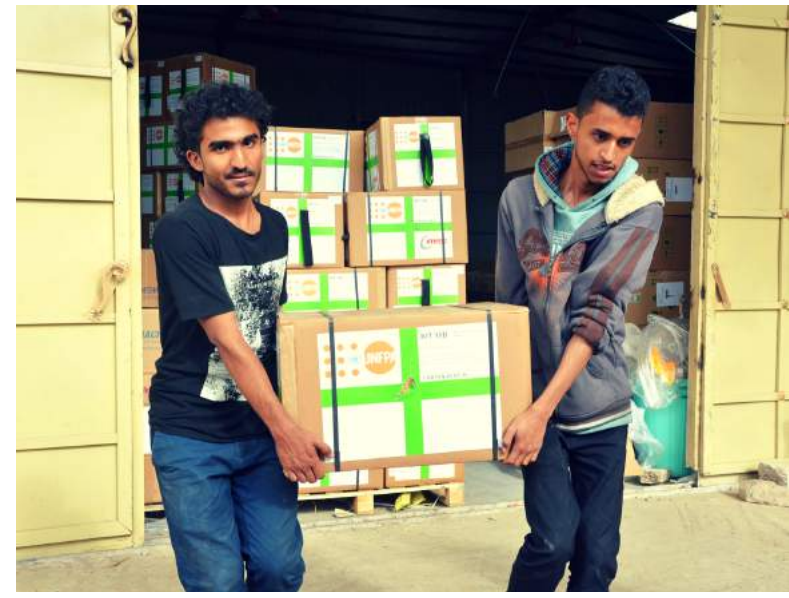
UNFPA reproductive health kits being distributed to health facilities.